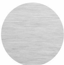
SATIN CHROME FINISH