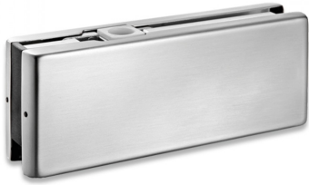
KGT200SS top patch fitting glass notch