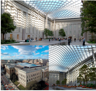
Smithsonian American Art Museum - Washington, DC 2016 Vulnerable horizontal glass can become easily corroded and quite labor intensive to clean. Invisible Shield coating was applied many years ago to preserve the glass and reduce the cleaning overall.