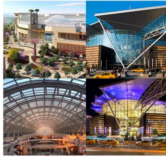
Istinye Park Izmir - Turkey 2020 Glass is one of the most alluring yet delicate compounds on the planet, often times it is damaged before it is even installed. Invisible Shield is being tested to treat much of the new glass construction.