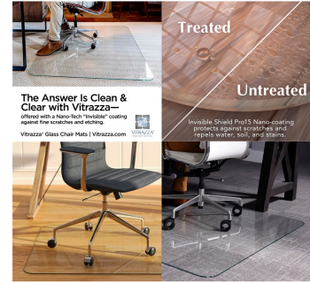
The Answer Is Clean & Clear with Vitrazza™ offered with a nano-tech "invisible" coating against fine scratches and etching. Vitrazza® Glass Chair Mats | Vitrazza.com Treated Untreated Invisible Shield Pro15 Nano-coating protects against scratches and repels water, soil, and oil/dirt. Vitrazza Glass Chair Mats Vitrazza's femora glass floor mats have included the Invisible Shield nanotech coating to help prevent etching, scratches for an easy, smooth glide.